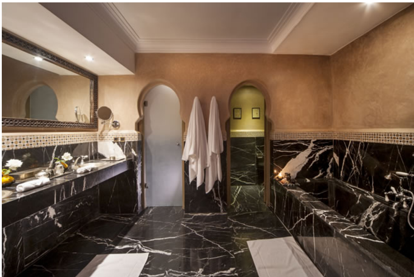
The hotel offers 12 individually styled bedrooms, each with beautifully designed bathrooms

About us Contact us Advertise Get your company featured Work for us Sign up for email