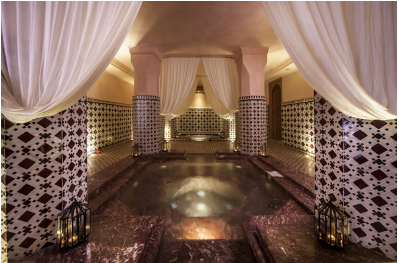
The hotel offers luxurious spa facilities