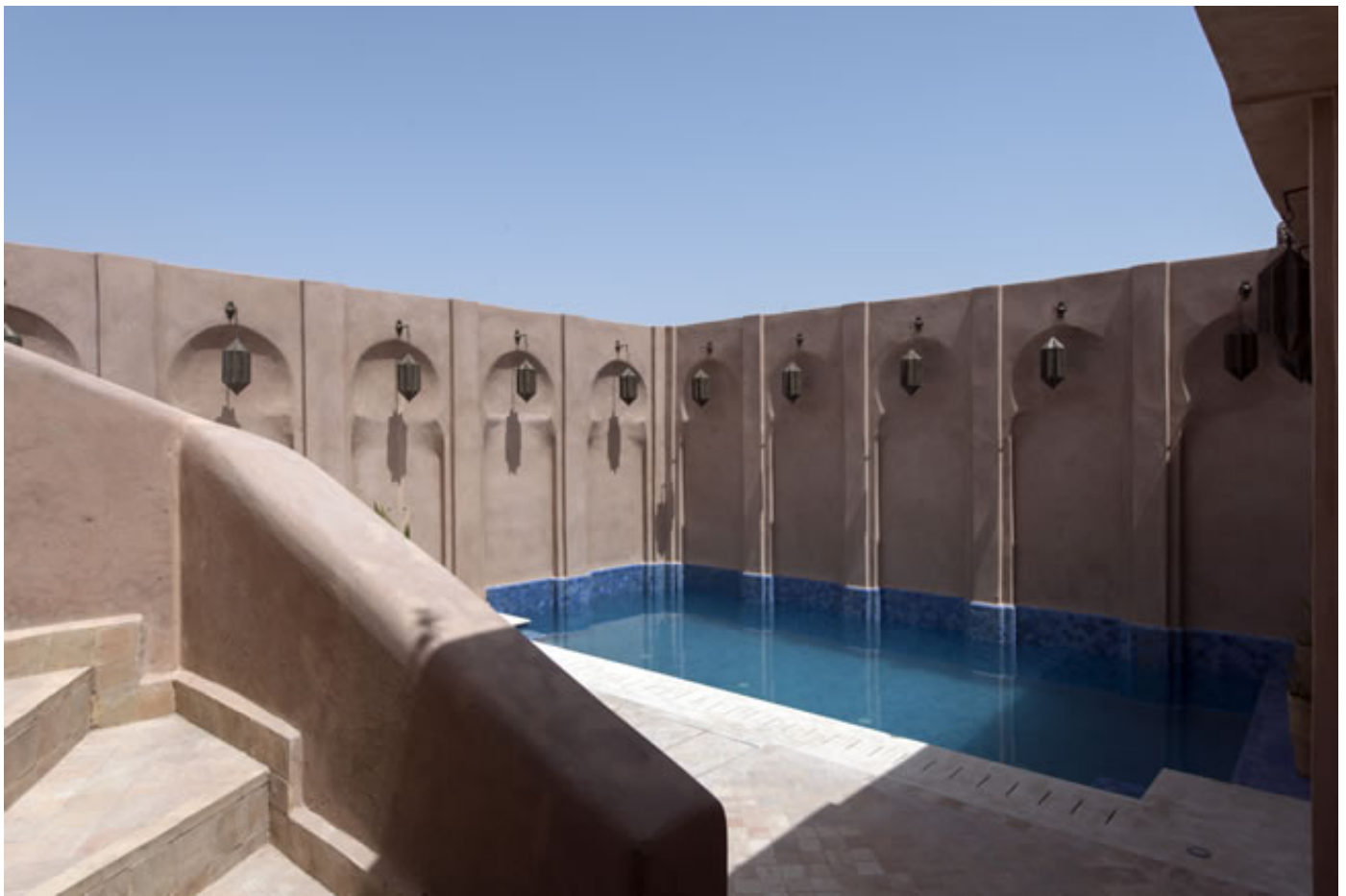
Almaha Marrakech embraces tranquillity

The hammam and spa at Almaha Marrakech has been created by Charles using zellige elements (mosaic patterned tiles) designed to enhance the guests’ peaceful state of mind. Five different hammam rituals are available and additionally ten massages are offered.